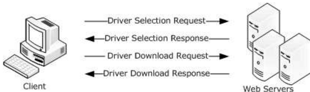
Figure 1: Client selection and download of printer driver

The Web Point-and-Print Protocol provides a mechanism for clients to download printer driver software from a server in the client network or from a website, or directly by print devices. <1>