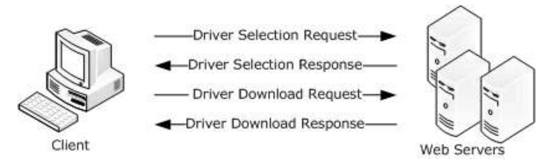
Figure 1: Client selection and download of printer driver

A Web Point-and-Print Protocol web server maintains a list of printer drivers. A client makes a Driver Selection Request (section 2.2.4) to obtain a printer driver of a particular type and for a particular client configuration. If the server locates a printer driver that matches these requirements, the server redirects the client to the location of the printer driver through the Driver Selection Response (section 2.2.5).