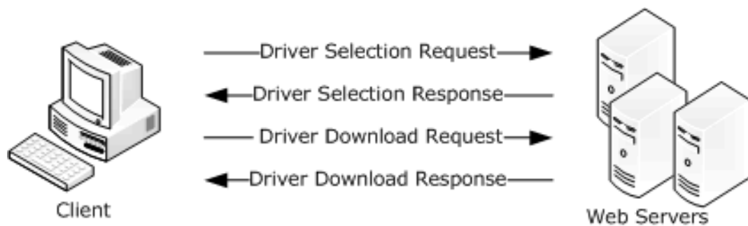
Figure 1: Client selection and download of printer driver

A Web Point-and-Print Protocol web server maintains a list of printer drivers. A client makes a Driver Selection Request (section 2.2.4) to obtain a printer driver of a particular type and for a particular client configuration. If the server locates a printer driver that matches these requirements, the server redirects the client to the location of the printer driver through the Driver Selection Response (section 2.2.5).