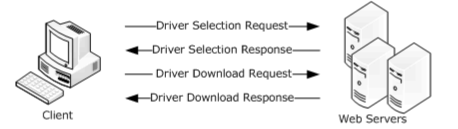
Figure 1: Client selection and download of printer driver

The Web Point-and-Print Protocol provides a mechanism for clients to download printer driver software from a server in the client network or from a website, or directly by print devices. \leq 1 \geq