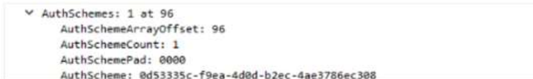
Figure 3: AuthSchemes contents

AuthSchemes contains the list of supported security mechanism IDs, in decreasing order of preference, that is sent by the initiator to the acceptor. In this negotiation, as shown in the following figure, the initiator supports only one security mechanism (1 of 96), count 1, with its unique ID in the AuthScheme field.