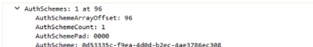
Figure 3: AuthSchemes contents

AuthSchemes contains the list of supported security mechanism IDs, in decreasing order of preference, that is sent by the initiator to the acceptor. In this negotiation, as shown in the following figure, the initiator supports only one security mechanism (1 of 96), count 1, with its unique ID in the AuthScheme field.